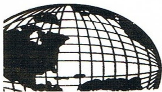
McAlpine Mill Site

The most common last name in Canada is "Li".