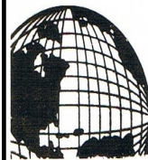
McAlpine Mill Site

In a large bowl, combine the first 7 ingredients; beat until smooth. Line a 9-in. pie plate with pastry; trim and flute edges. Pour filling into crust. Bake at 425° for 15 minutes. Reduce heat to 350°. Bake 45-50 minutes longer or until crust is golden brown and top of pie is set (cover edges with foil during the last 15 minutes to prevent overbrowning if necessary). Cool on a wire rack for 1 hour. Refrigerate overnight or until set. In a small bowl, beat the cream, confectioners' sugar, syrup and pumpkin pie spice until stiff peaks form. Pipe or dollop onto pie. Sprinkle with pecans if desired. Makes 8 servings