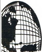
McAlpine Mill Site